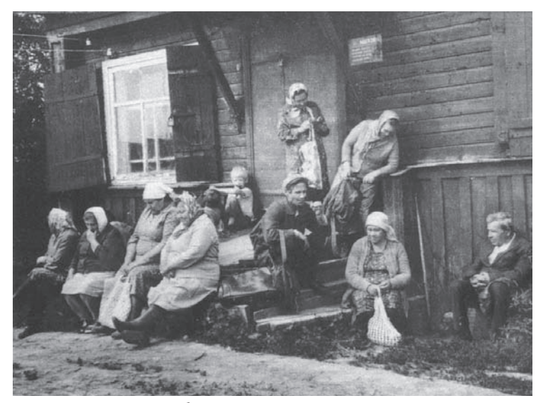
Russian peasants. Ogonyok..