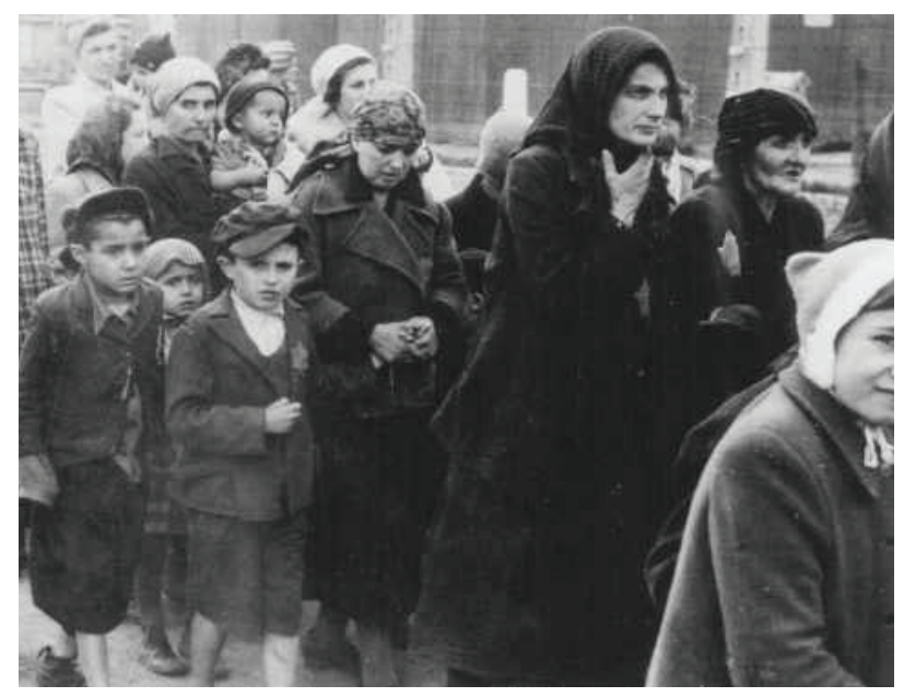
Hungarian Jews on their way to the gas chambers. Auschwitz-Birkenau, Poland, May 1944.