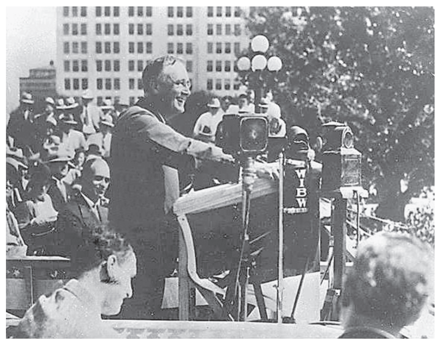
Franklin D. Roosevelt's nomination as the Democratic candidate for President was far from assured when the 1932 convention met in Chicago; it took four ballots, and a knock-down drag-out political fight against the London-Wall Street interests who backed FDR's opponents. He is shown here campaigning in Kansas in 1932.

basic facts about the election of 1932. Few, however, know how close the nation came to a disaster at the Democratic nominating convention in Chicago; how close FDR came to being deprived of the Presidential nomination, despite