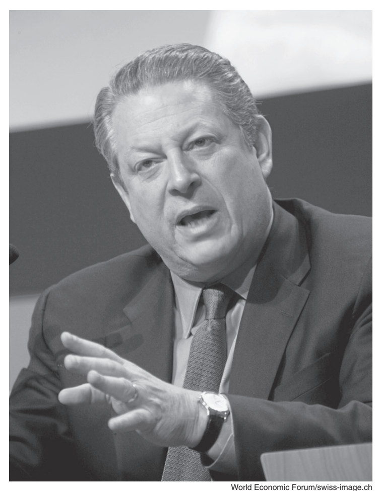
Al Gore at the Davos meeting in January 2008.

dorsed Anwar Ibrahim over Mahathir to lead the nation.<sup>6</sup> Sprinkling salt in the wound, Gore echoed Anwar's cries for a new government: "People will accept sacrifice in a democracy, not only because they have had a role in choosing it, but because they rightly believe they are likely to benefit from it.... The message this year from Indonesia is unmistakable: People are willing to take responsibility for their future—if they have the power to determine that future.... Democracy confers a stamp of legitimacy that reforms must have in order to be effective. And so, among nations suffering economic crises, we continue to hear calls for democracy and reform in many languages-'people's power,' 'doi moi,' 'reformasi.' We hear them today-right here, right now-among the brave people of Malaysia." With the Malaysian government incensed and the Malaysian people riled up, Gore promptly left the venue. A few days later,