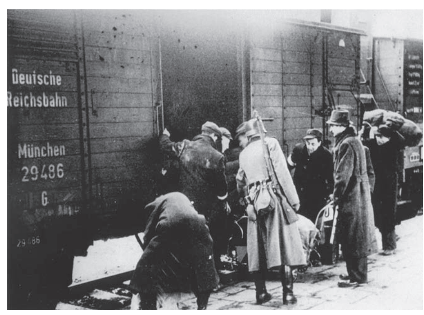
A member of the German SS supervises the boarding of Jews onto trains during a deportation action in the Krakow ghetto.

that would send lots of people to the psychiatric couch for many, many years. Was it difficult?