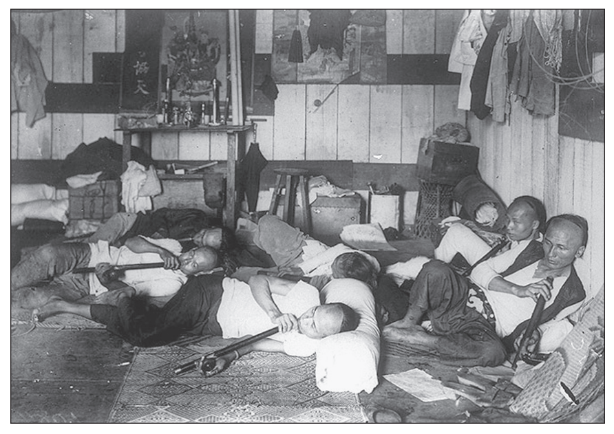
An opium den in Manila, the Philippines.