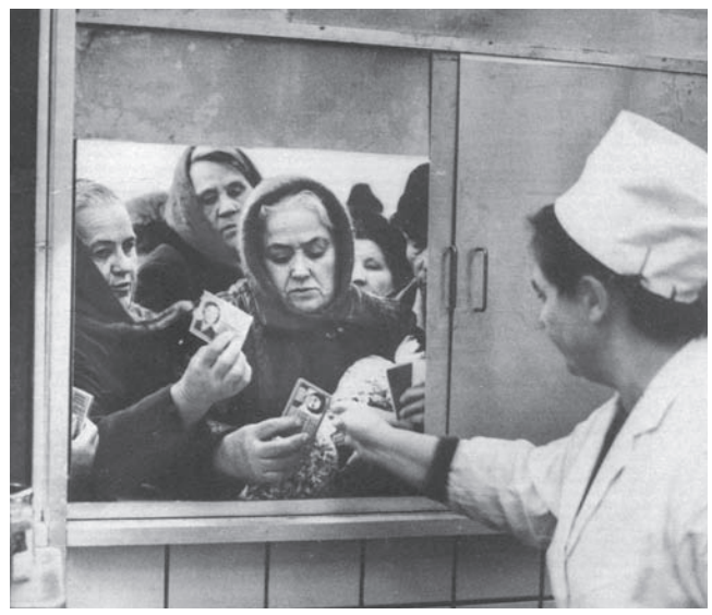
Soviet women show ration cards to buy food. Ogonyok 1991.

the coming two years will decide the fate of all humanity for a century or more to come...The time has come for a bold decision on U.S. policy toward Central Europe." At that time, the LaRouche Movement was recruiting from the influential circles throughout Eurasia around the prospect of building the Productive Triangle and later the Eurasian Land Bridge to transform the region into a prosperous community of nation-states.