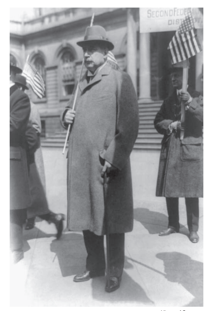
During the 1920s, J.P. Morgan (shown here), and allied London and Wall Street banking interests financed Italy's Fascist dictator Mussolini. They intended to establish Fascism in the United States but they had to try to eliminate FDR in order to do it.

cal intimidation factor. Cermak had gone East on the eve of the convention, to meet with Raskob and Shouse, ostensibly to push an anti-Prohibition plank for the party platform.