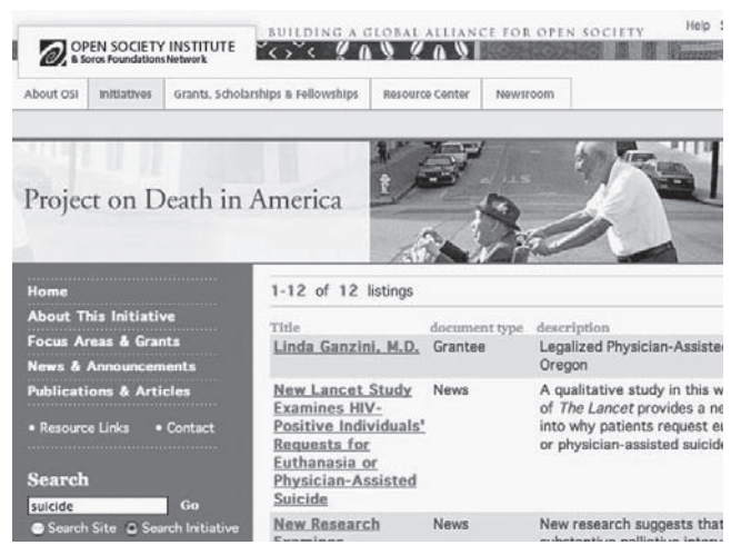
Project on Death in America website.