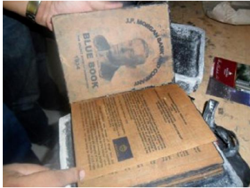
Team-K got a copy of the JP Morgan Blue Book with an overview of the Cabal families that illegally controlled the black shadow economy.

Chris Bosnahan: "The Black Books got the